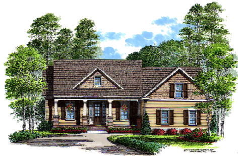
The Edisto Island 2,349 approx. heated sq. ft.