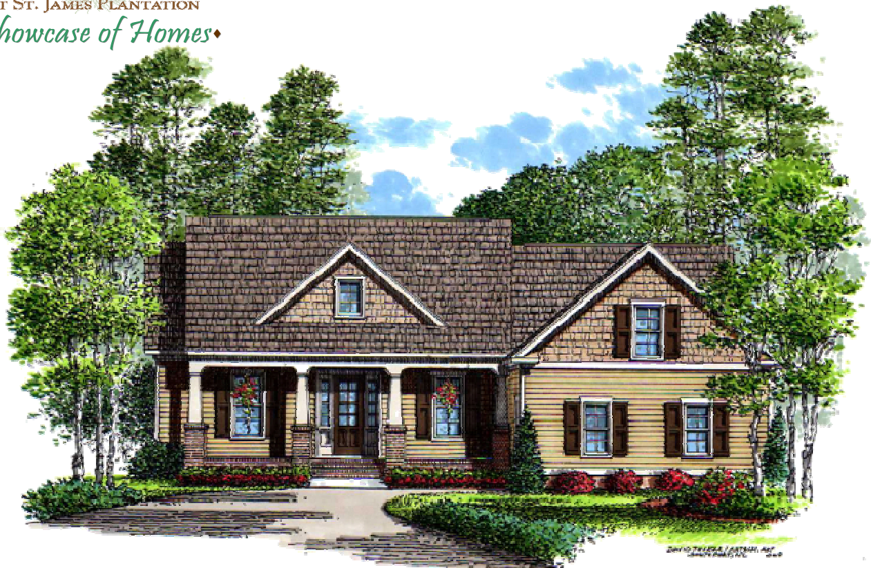
The Edisto Island