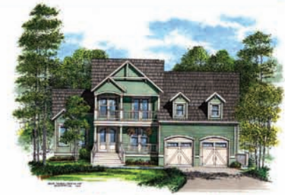
The Longleaf 2,537 approx. heated sq. ft.