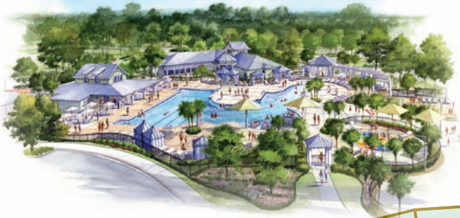
SEASIDE CLUB Opening Spring 2011

To the SeaSide Club and new gated entrance. Two mile drive to the beach!